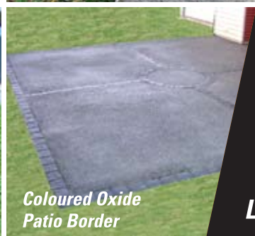
Coloured Oxide Patio Border